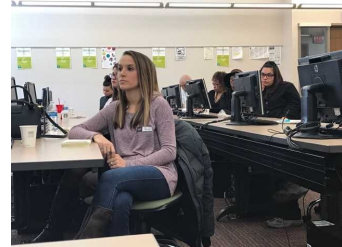
Cuyahoga Community College