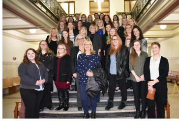
Des Moines Area Community College